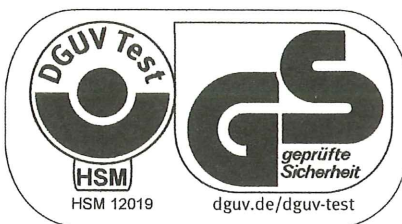
Approved design for a height of 20 mm or less: