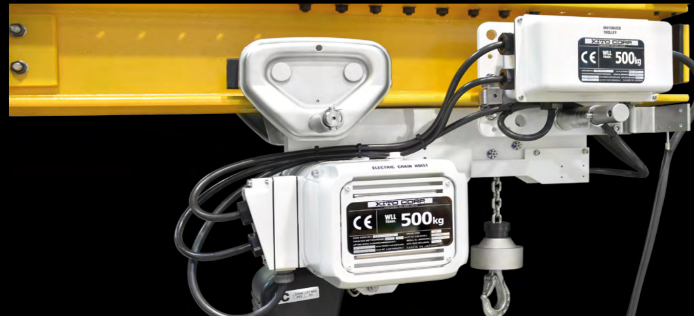
FER2 FOOD GRADE ELECTRIC CHAIN HOIST Low Headroom