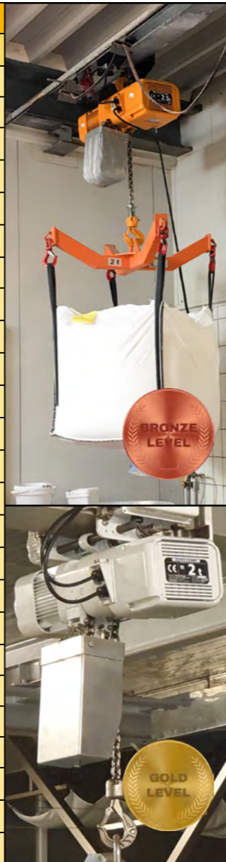
*2,500 kg - 5,000 kg with white epoxy painted load hook