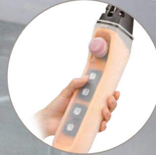
Optional silicone cover for the pendant