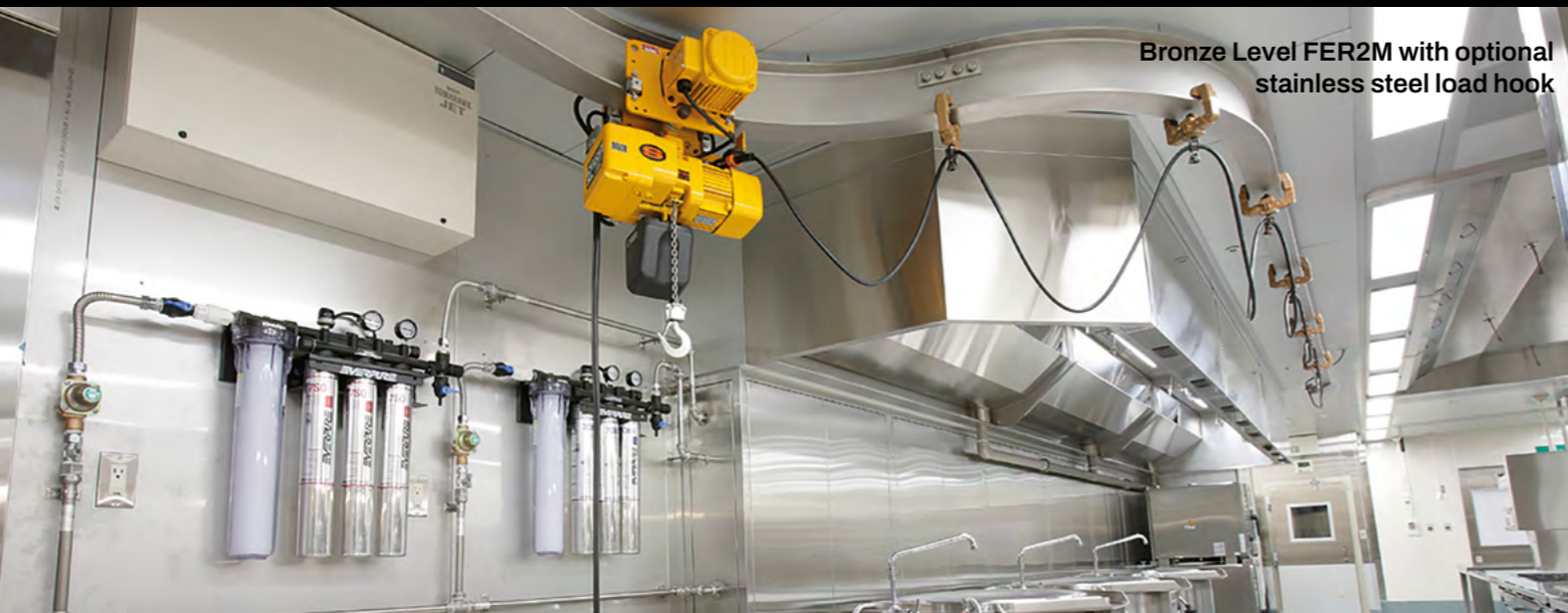
Bronze Level FER2M with optional stainless steel load hook