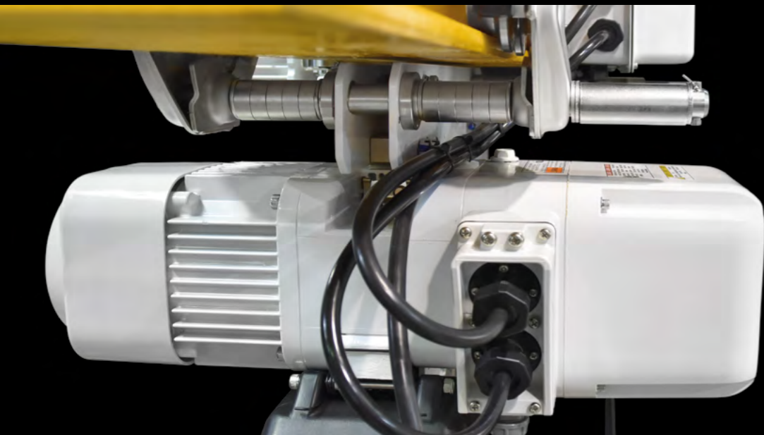
FER2 FOOD GRADE ELECTRIC CHAIN HOIST Custom build